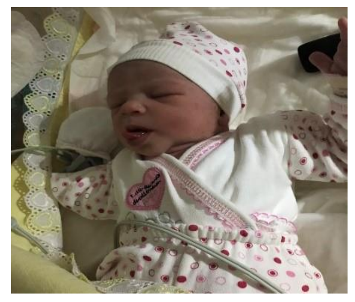
Figure 3.Newborn's response to areolar odor.